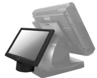
Rear mount bracket for optional 12" 2nd display (LM6000 Series)