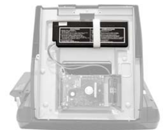
Optional built-in battery