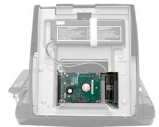
Built-in removable 2.5" HDD in base stand